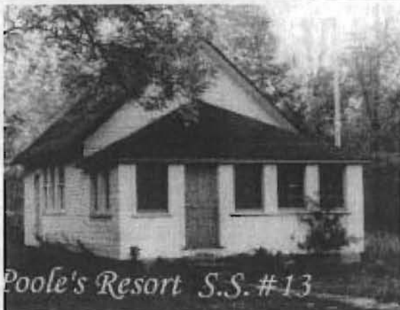
Poole's Resort S.S. #13

The Historical Society made an application to the Provincial Ministry of Culture for a Heritage Organization Development Grant. Our application was approved, and we received $466.00. This grant will be used to cover the cost of preparation and distribution of this Newsletter. We wish to thank the Ministry of Culture for this assistance.