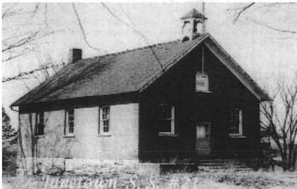
Junetown S.S. #21