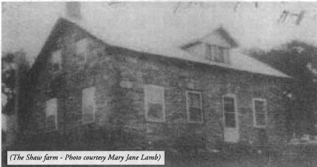
(The Shaw farm -)