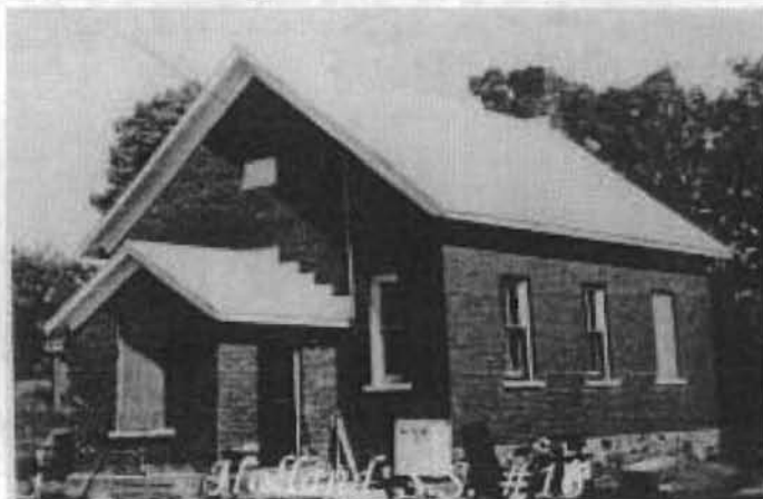
Holland S.S. #18