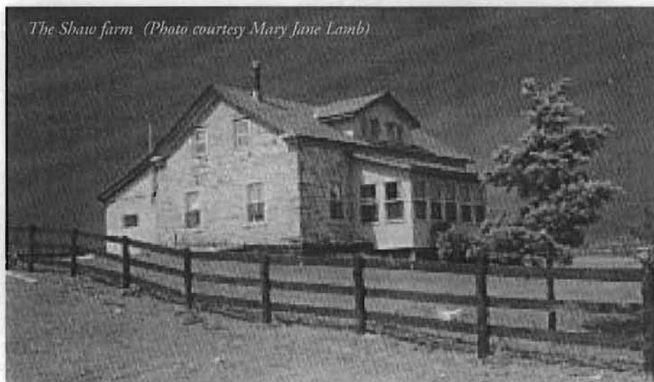
The Shaw farm

Farm Settled in 1792 By Irish Elopers Searched For Bag of Coins Since Unknown U.S. Visitors Left in 1860's