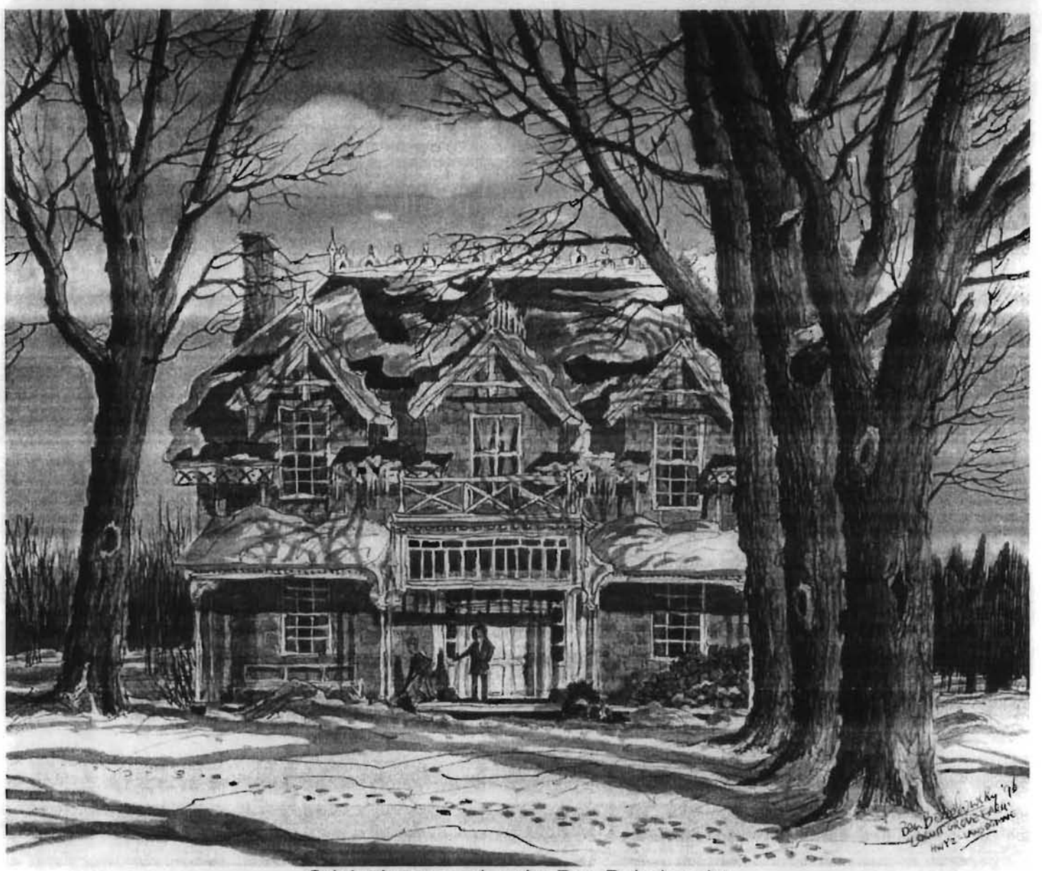
Original water colour by Ben Babelowsky (see Pg. 6)