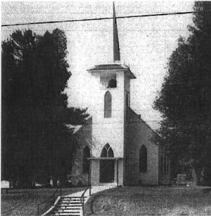
OLIVET UNITED CHURCH