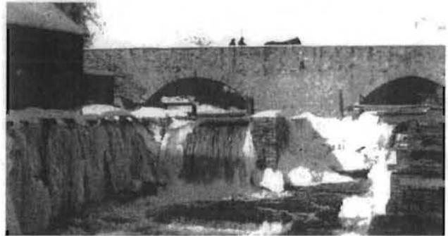
THE LYNDHURST BRIDGE

was in continuous service from 1857 until 1986 when it was rebuilt.. Despite the fact that it was designed for horse drawn vehicles and cargo, it withstood the loads of modern semi-trailer gravel trucks of 70 tons.