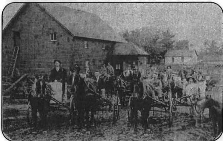
This article was written with assistance from the Municipal Heritage Committee album, and The Rear of Leeds and Lansdowne - The Making of Community on the Gananoque River.

The importance of cheese as a new cash crop for the local farmers is evident in this factory sending two wagon loads of thirty cheese each to Lyndhurst station each week for shipment by train to Brockville. There the products of 125 cheese factories in Leeds county were auctioned by a marketing board.