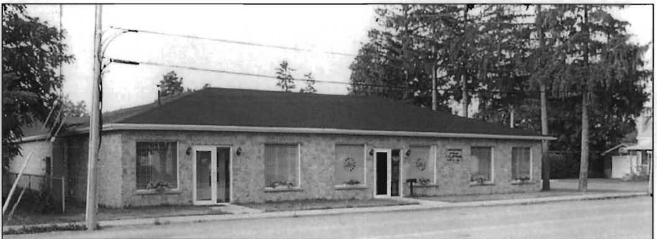
Lansdowne Rural Telephone Co., Office #3.