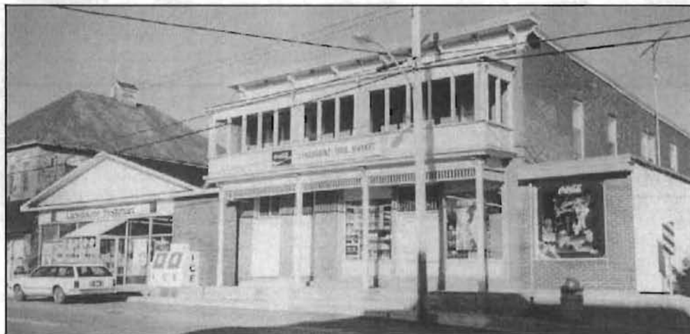
Lansdowne Freshmart. Photo by Hilary-Anne Hamilton 1993