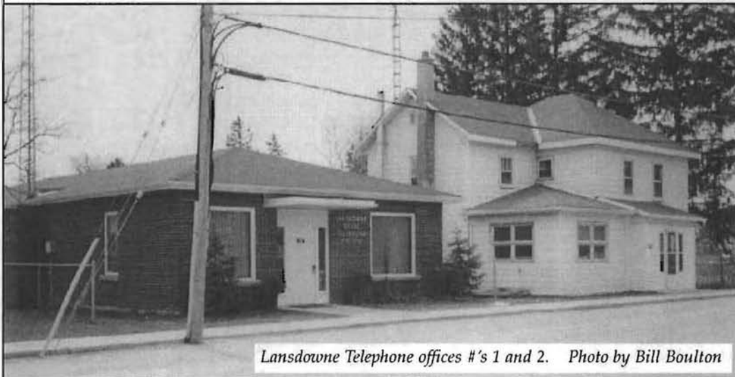
Lansdowne Telephone offices #'s 1 and 2.