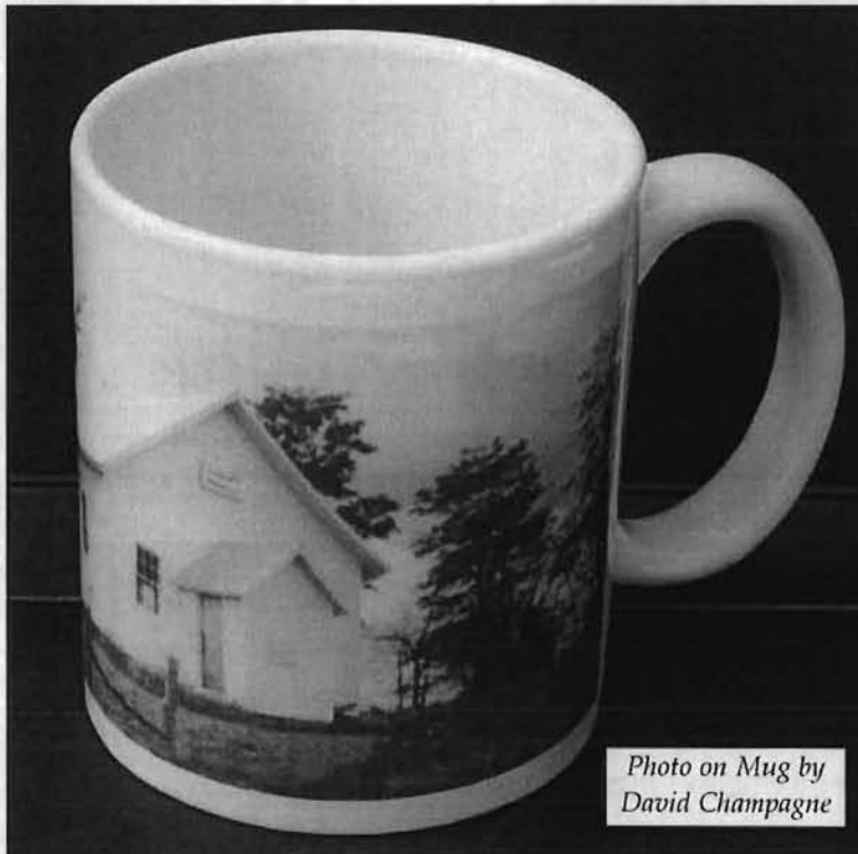
Photo on Mug