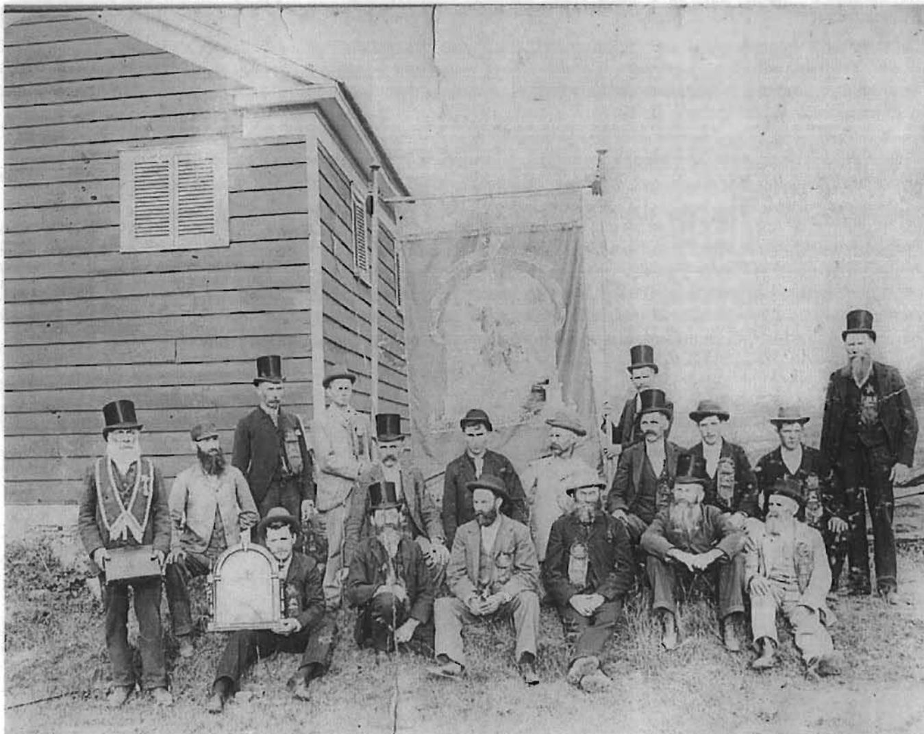
Dulcemaine Orange Lodge #100 Charter - July 12, 1898 (see Pg. 12)