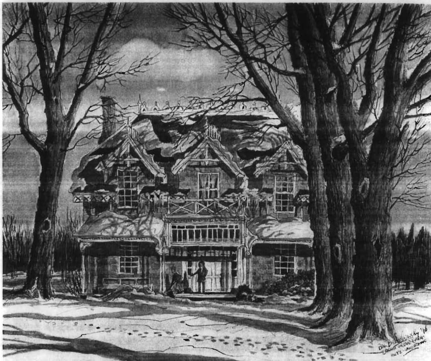
Original water colour by Ben Babelowsky (see Pg. 6)