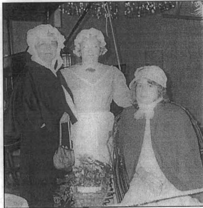
THE BELLES OF THE HERITAGE FAIR '94